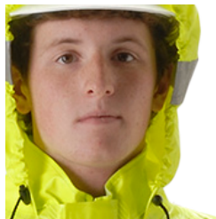
PROTECTION Hood in collar.