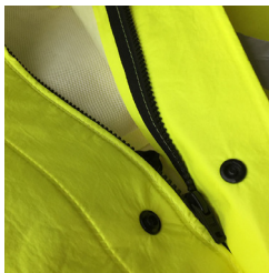
QUALITY Storm fly front with zipper.