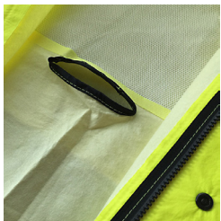
SAFETY Fall protection access.