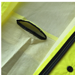
SAFETY Fall protection access.

ArcLite Air will be YOUR choice for FR rainwear.