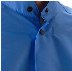
PROTECTION Storm Fly Front