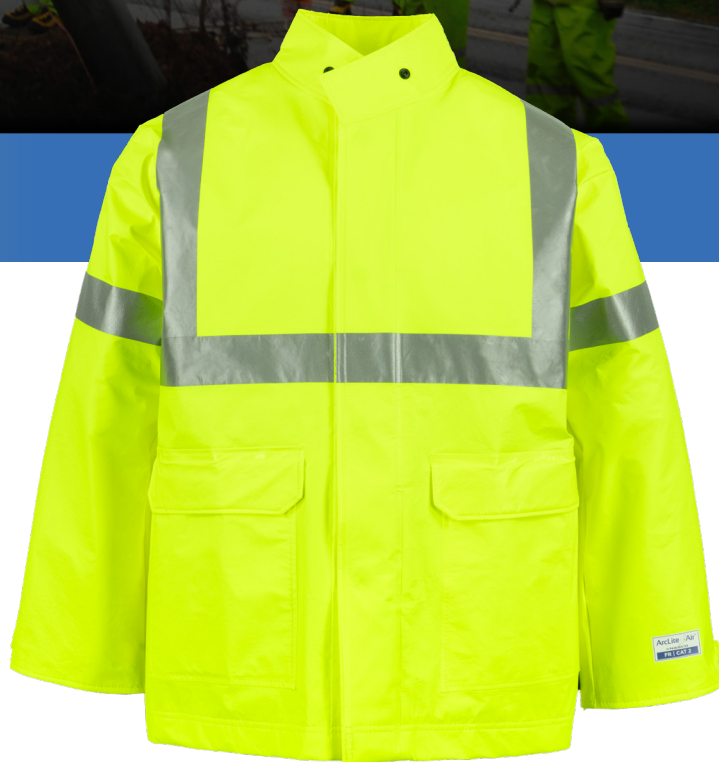
Men's ArcLite Air

ArcLite Air will be YOUR choice for FR rainwear.