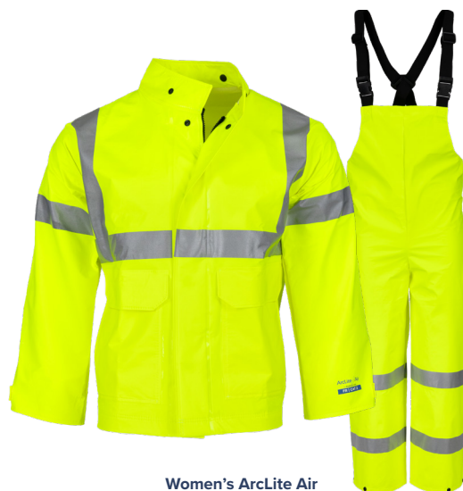
Women's ArcLite Air