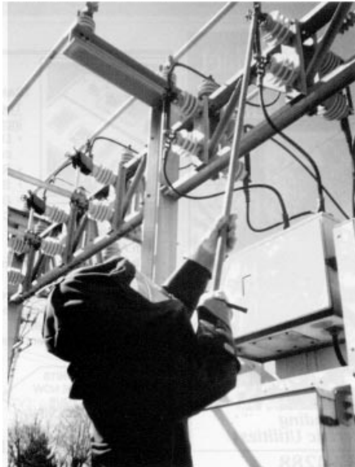
For severe arcing conditions, complete switchwear, faceshield, and hood are prudent requirements. This face shield is supplied by Steel Grip Inc, Danville, IL.

Obviously, the No. 5 shade is not practical for many